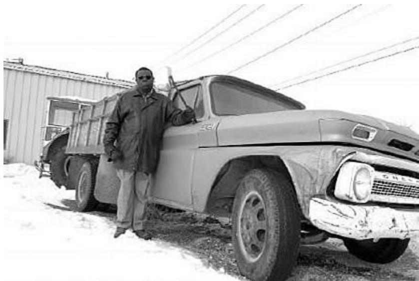
Photograph by : Don Healy, Leader-Post

By Braden Husdal Copyright 2008 The LeaderPost. Used with permission